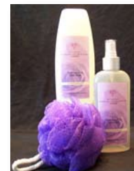
Body Wash & Mist Combo $22.95

Pour this pure, all-organic sweet almond oil flushed with our signature, hypnotic rosewood blend on arms, legs- all over- and allow yourself (or someone you love) a full hour of relaxation! You'll rise from the Bathsheba massage feeling renewed, uplifted, confident, and loved. Bathsheba is pure bliss!