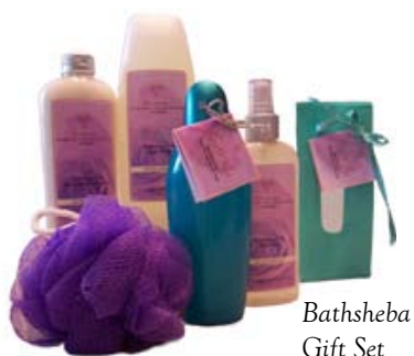
Bathsheba Gift Set

But watch out! A little goes a long way.