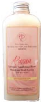
Shea Butter Hand & Body Lotion $12.95 - 6 oz With 20% Shea Butter

This texturally pleasing, greaseless Shea Butter based balm glides on in a super smooth, protective swathe, instantly softening dehydrated skin surfaces. Created to conquer unsightly age spots, stretch marks, and body wrinkles.