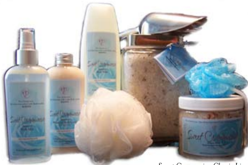
Sweet Communion Classic Line