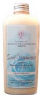
Shea Butter Hand & Body Lotion With 20% Shea Butter

This texturally pleasing, greaseless Shea Butter based balm glides on in a super smooth, protective swathe, instantly softening dehydrated skin surfaces. Created to conquer unsightly age spots, stretch marks, and body wrinkles.