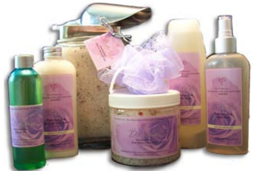
Bathsheba Classic Line