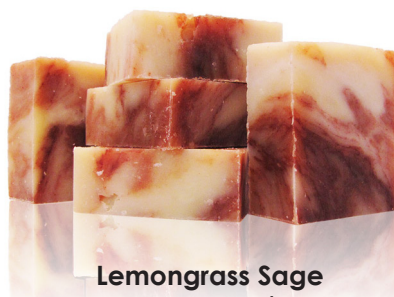
Lemongrass Sage Natural Soap $7.50

Eucalyptus Natural Soap from Castle Baths brings the fresh scent of eucalyptus to your tub or shower to create an energizing bathing experience.