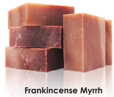
Frankincense Myrrh Natural Soap $9.00

Combining the relaxing and rejuvenating benefits of lemongrass with the stimulating powers of sage, this bar of soap is sure to help lift your spirits and leave your skin feeling soft and smooth.