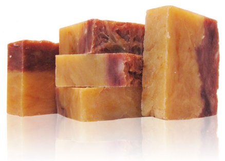
Bay Rum Natural Soap $7.50

Eucalyptus Spearmint Natural Soap from Castle Baths brings the freshness of eucalyptus and the stimulating aroma of spearmint together to create an energizing bathing experience.