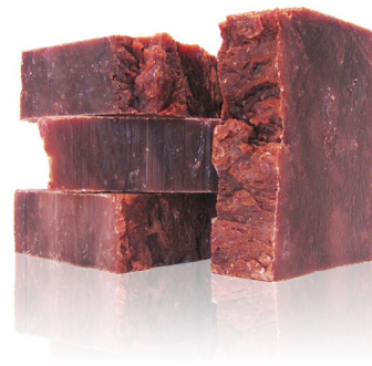
Vanilla Silk Natural Soap $9.00

This handmade bar of soap can help reduce the appearance of wrinkles and age spots on skin, thanks to its being made with the highest quality essential oil of Rosewood and other organic ingredients.