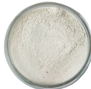
Sensitive Skin Face Mask 2oz.... $7.00

This face mask is made with gray illite clay and infused with raspberry seeds to not only cleanse your face, but also deliver numerous anti-aging benefits too.