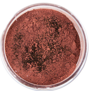
Fruit Fiber Face Mask 2oz.... $8.00

This natural clay mask is formulated to provide soothing relief while cleansing and detoxifying your pores