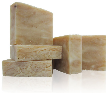
Oriental Lime Natural Soap $7.50

This natural soap is scented in the essential oil of Bergamot to deliver the scent of real key lime pie! Use a bar the next time you bathe or shower and make the experience as delectable as the dessert itself.