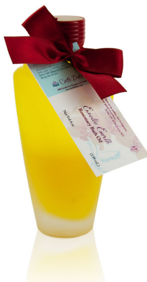
Rosemary Bath Oil $27.00

This bath oil is sweet and deliciously scented in the essential oil of pink grapefruit for an invigorating aromatherapy experience.