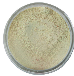
Detoxifying Face Mask 2oz.... $7.00

This mask is made with Black Kaolin clay, which feeds your skin with the minerals it needs to combat acne on its own, and can help stabilize other causes of acne such as your skin's pH level.