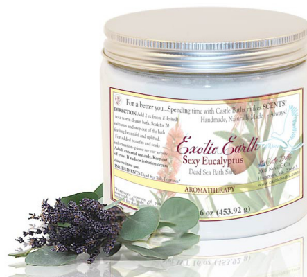
Sexy Eucalyptus Bath Salts $27.00

Green tea and Dead Sea Salts both offer a natural detox skin care solution, and even more so when they are combined! Experience skin care sea salt benefits like never before with this unique blend of bath salts.