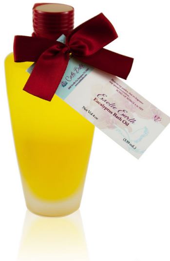
Eucalyptus Bath Oil $27.00

Just like Chamomile tea, the soothing scent of this bath oil will help you unwind after a hectic day. The fact that the oil itself will help moisturize and nourish your skin just makes it even better!