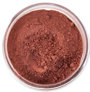
Absorbent Face Mask 2oz.... $7.00

This mask is made with pure bentonite clay, which can trap toxins and draw them out to your skin's surface so they can be washed away.