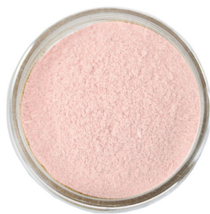
Soothing Sensitive Face Mask 2oz.... $8.00

Castle Baths' Soothing Sensitive Face Mask combines white and pink kaolin clays to create a soft, smooth, creamy facial mask to soothe sensitive skin.