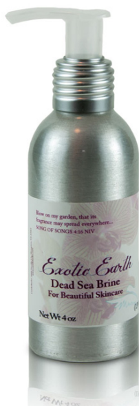
Dead Sea Brine 4oz.... $12.95

The anti-aging benefits of bathing in the waters of the Dead Sea have been known since Biblical times. Now, you can experience them for yourself with Castle Baths' pure, authentic Dead Sea Brine.