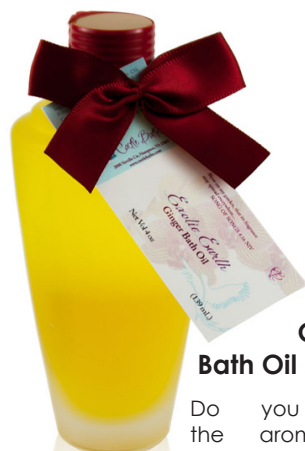
Ginger Bath Oil $27.00

Geranium Rose Bath Oil is scented like an English Tea rose with aromatherapy benefits to sooth a woman's mood. If garden roses are your preferred scent, try this enticing oil blend complete with moisturizing benefits.