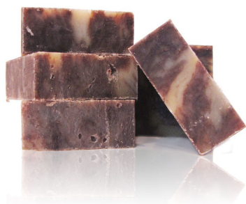
Patchouli Orange Natural Soap $7.50

Bathe with a bar of this popular, handmade soap preserve your youthful looks while you enjoy it's relaxing aroma. This natural soap is made with the essential oil of Neroli for antibacterial and anti-aging benefits.