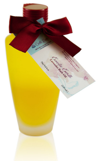
Lavender Bath Oil $27.00

One of Castle Baths' most popular bath oils, Patchouli is specifically blended for the recalling of fond memories of yesteryear. And while the aroma is reminding your mind of the way things used to look, the oil will be reminding your skin how it used to feel as it moisturizes and soothes your body