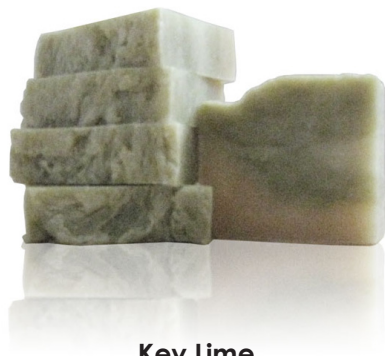
Key Lime Natural Soap $7.50

This natural soap is scented in the essential oil of Bergamot to deliver the scent of real key lime pie! Use a bar the next time you bathe or shower and make the experience as delectable as the dessert itself.