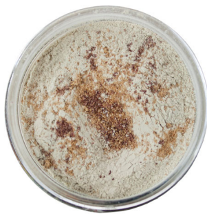
White Apple Face Mask 2oz.... $7.00

Castle Baths' Soothing Sensitive Face Mask combines white and pink kaolin clays to create a soft, smooth, creamy facial mask to soothe sensitive skin.