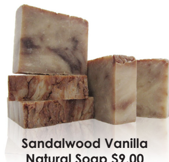
Sandalwood Vanilla Natural Soap $9.00

This handmade bar of soap is scented in the empowering scent of sandalwood from Castle Baths. The aroma of sandalwood is said to inspire the euphoric feeling of wanting to cuddle after a picnic in the park.