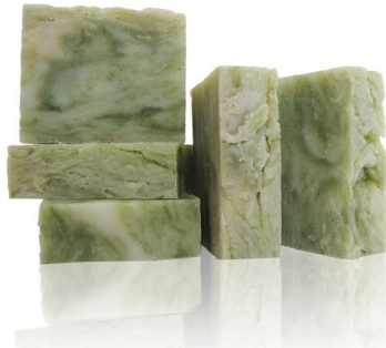
Eucalyptus Spearmint Natural Soap $7.50

Rejuvenate and moisturize your skin with the sweet, tropical scent of coconut oil contained in this handmade bar of soap. Relax, and let its aroma take you back to your favorite beach vacation.