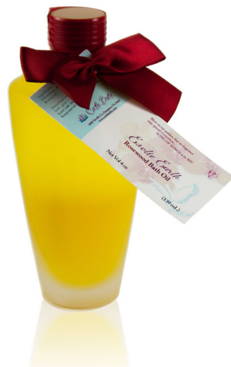
Rosewood Bath Oil $32.00

If you feel the need to refresh and refocus yourself, try adding a few drops of Rosemary Bath Oil to your next bath. Its slightly floral, mostly minty scent will help your mind stay alert while feeding your skin with moisturizers.