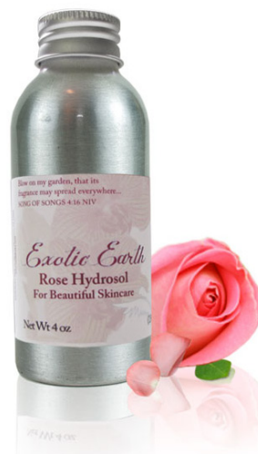
Pure Rose Hydrosol 4oz.... $30.00

Easily absorbed, Rice Bran Oil is more effective than lanolin and a great moisturizer for severely dry skin, uncomfortable skin rashes, sunburn and other conditions such as psoriasis, dermatitis, rosacea and eczema.