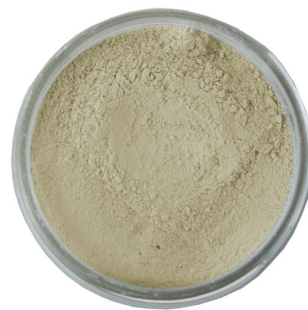
Sea Clay Face Mask 2oz.... $8.00

Castle Baths' White Apple Face Mask is made with white kaolin clay to provide a soothing, creamy texture perfect for use on sensitive skin, and it is infused with apple powder to provide numerous anti-aging benefits.