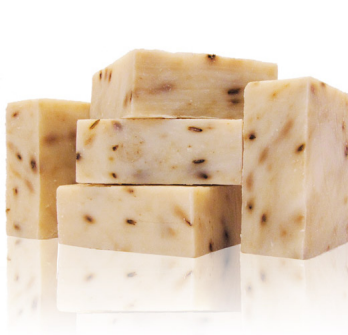
Lavender Natural Soap $7.50

The Fall harvest is in! Experience its spice and zest in your next bath or shower. This natural soap encapsulates the scents of roasted nuts and fresh baked goods for a "home cooking" atmosphere