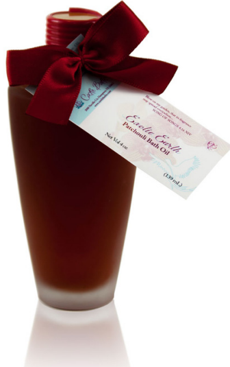
Patchouli Bath Oil $27.00

Do you love the aroma of gingerbread in winter? If so, you'll probably love the scent of this natural bath oil, because they're one in the same!