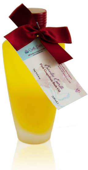
Pink Grapefruit Bath Oil $27.00

This bath oil is sweet and deliciously scented in the essential oil of pink grapefruit for an invigorating aromatherapy experience.