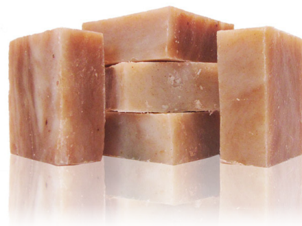
Neroli Chamomile Natural Soap $9.00

Finally, a way for people with sensitive noses to enjoy the benefits of natural soap! Oriental Lime Natural Soap is lightly scented, giving you an Asian feeling with a hint of lime.