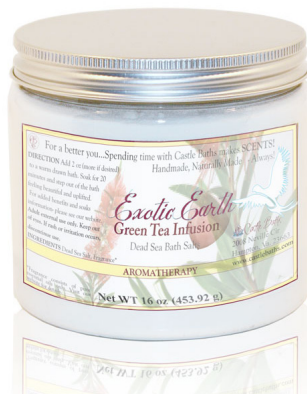
Green Tea Bath Salts $27.00

Note: Exotic Earth bath salt pictures and prices are for 16oz containers.