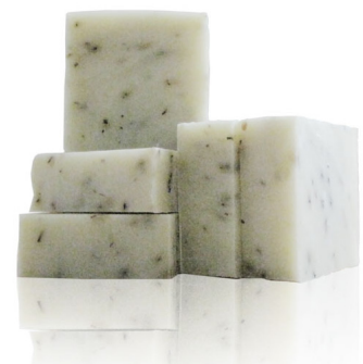
Eucalyptus Natural Soap $7.50

According to studies, lavender is one of the most universally preferred scents in the world, and we've encased it in this moisturizing bar of natural soap.