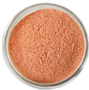
White Apple Face Mask 2oz.... $7.00

Castle Baths' Oxygenating Face Mask is made with pure orange illite clay to help open up your pores and infuse your facial skin with the minerals and oxygen it requires.