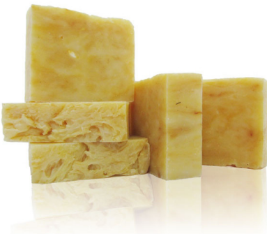
Cinnamon Almond Natural Soap $7.50

Whether it's sweet, masculine scent reminds you of your last visit to the Caribbean or a classic old-town barber shop, it's sure to appeal to men and women of all age groups.