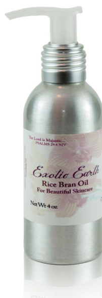
Cold-Pressed Rice Bran Oil 4oz.... $12.00

Sunflower Oil is non-comedogenic, and can be rubbed into your skin without generating pimples or spots. It is also reputed to be helpful in reducing the appearance of acne, according to folk skin care traditions.