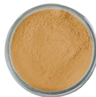
Sandalwood Face Mask 2oz.... $9.00

This mask is made with pure red kaolin clay for intense absorbing abilities to deep-cleanse your pores, and is also rich in antioxidant vitamins thanks to its added fruit fiber.