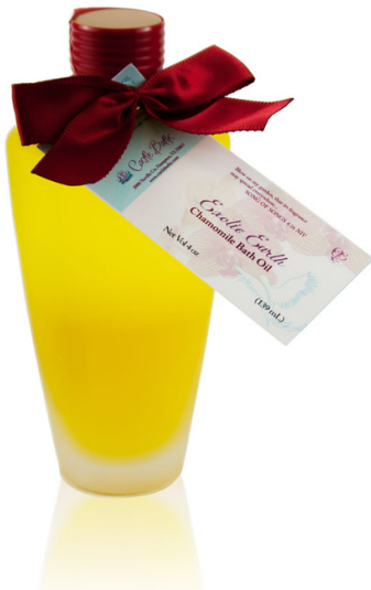
Chamomile Bath Oil $32.00

Just like Chamomile tea, the soothing scent of this bath oil will help you unwind after a hectic day. The fact that the oil itself will help moisturize and nourish your skin just makes it even better!