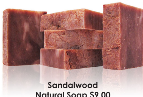
Sandalwood Natural Soap $9.00

This natural, handmade soap, is scented with sexy vanilla and delivering an alluring silky feel to your skin to help you be a delight for your knight tonight