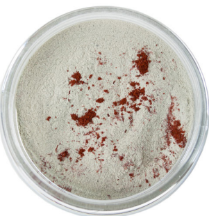
Gray Raspberry Face Mask 2oz.... $8.00

Castle Baths' Sandalwood Face Mask delivers numerous anti-aging benefits to help infuse your skin with nutrients while detoxifying and toning at the same time.