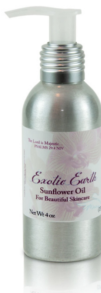
Cold-Pressed Sunflower Oil 4oz.... $12.00

The anti-aging benefits of bathing in the waters of the Dead Sea have been known since Biblical times. Now, you can experience them for yourself with Castle Baths' pure, authentic Dead Sea Brine.