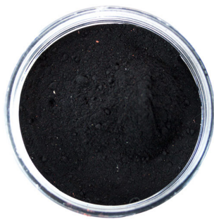
Anti-Acne Face Mask 2oz.... $9.00

Castle Baths' Oxygenating Face Mask is made with pure orange illite clay to help open up your pores and infuse your facial skin with the minerals and oxygen it requires.