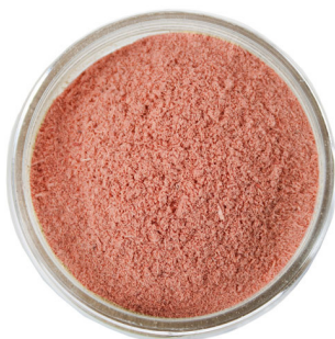
Soothing Anti-Irritant Face Mask 2oz.... $7.00

Castle Baths' Sea Clay Face Mask is made with pure sea clay, and infused with sea algae and other nutrients to give you great detox and anti-aging benefits!