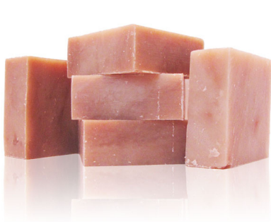
Coconut Cream Natural Soap $7.50

Rejuvenate and moisturize your skin with the sweet, tropical scent of coconut oil contained in this handmade bar of soap. Relax, and let its aroma take you back to your favorite beach vacation.