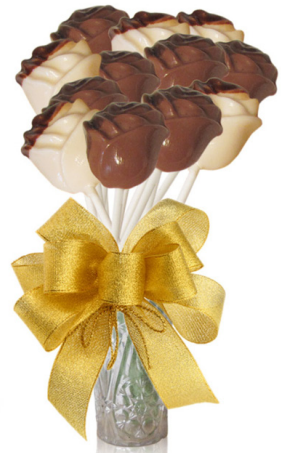
Right: One Dozen Chocolate Roses; Left: One Dozen Friendship Roses

"They look so real and smell so good, you'd think they were edible, though your taste buds may disagree."