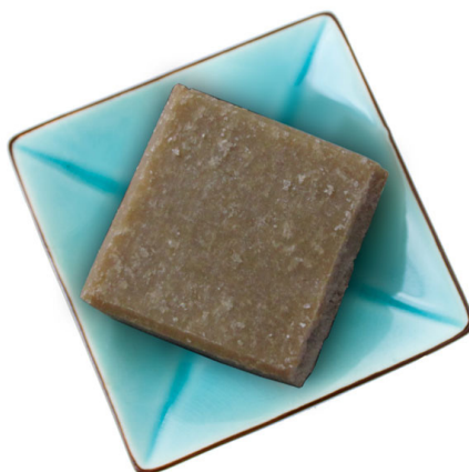
Dead Sea Salt Soap 3.5oz.... $24.00

Castle Baths' Cellu Coffee Bar is made with actual fair trade coffee grounds to give it a scratchy (but good scratchy) feel on your skin, plus numerous antioxidant vitamins to help keep your skin looking healthy and youthful.