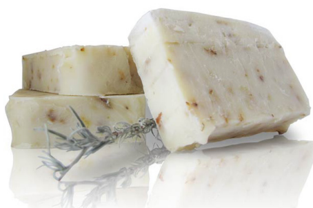
Lavender Rosemary Spa Soap 3.5oz.... $12.00

This bar of soap is absolutely packed with vitamins and moisturizing ingredients for the most exquisite feeling of cleanliness. Scented in cocoa and vanilla, this soap is made with some of the best natural anti-aging ingredients in nature!