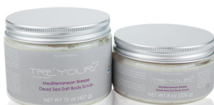
Mediterranean Breeze Dead Sea Salt Scrub 8oz.... $36.00 15oz.... $57.00

Use this mineral skin care bath scrub to exfoliate in style! For teens or adults! Get your skin ready for summer dresses and social gatherings with this all natural bath scrub made from organic spa-quality ingredients.