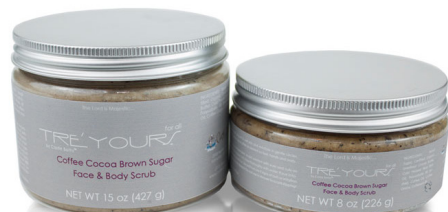
Coffee Cocoa Face & Body Scrub 8oz.... $36.00 15oz.... $57.00

Our Cocoa Coffee Scrub will not only purify your pores of all the dirt and dead skin cells that have been building up over time and dulling your skin's natural radiance, but also leave your skin infused with age-fighting nutrients and the aroma of a coffee-cocoa blend.