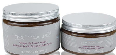
Ginger Lily Brown Sugar Scrub 8oz.... $36.00 15oz.... $57.00

Our Cocoa Coffee Scrub will not only purify your pores of all the dirt and dead skin cells that have been building up over time and dulling your skin's natural radiance, but also leave your skin infused with age-fighting nutrients and the aroma of a coffee-cocoa blend.