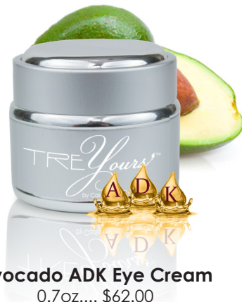
Avocado ADK Eye Cream 0.7oz.... $62.00

Not only is Avocado oil an oil-rich moisturizer, it also retains moisture in the skin. Avocado Eyes is our number one choice eye cream available to diminish the appearance of fine lines, wrinkles, dark circles, and puffy eyes!