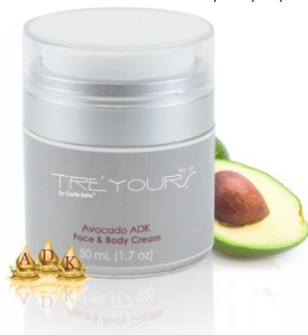
Avocado ADK Face & Body Cream 1.7oz.... $71.00

Rich, creamy and made with all the "superfoods" in our Avocado Eyes cream, plus food-grade vitamin A, D, and K dietary supplements for those who need a little extra help around the eyes.