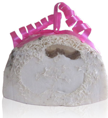
Exfoliating Loofah Soap for Her 5oz.... $17.00

This unique bar of natural soap merges the cleansing and moisturizing powers of natural soap with the gentle exfoliating abilities of a loofah to allow you to cleanse, exfoliate, and moisturize all at the same time.