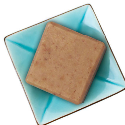
Renewal Face Soap 3.5oz.... $44.00

Rich in minerals and antioxidants, this Dead Sea Salt Soap will help firm and beautify your skin, giving it a youthful appearance. This soap is made with real Dead Sea Salt and seaweed extract, and hazelnut oil to help tighten and firm skin.