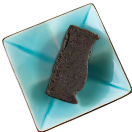
Cellu Coffee Bar 2oz.... $14.00

Castle Baths' Cellu Coffee Bar is made with actual fair trade coffee grounds to give it a scratchy (but good scratchy) feel on your skin, plus numerous antioxidant vitamins to help keep your skin looking healthy and youthful.