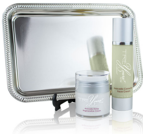
Avocado Corrective Face Cream & Hemp Regenerative Cream Combo for Her $259.00

Finally, a nighttime moisturizer exclusively for men! The Avocado Oil and Hemp Seed Oil in this natural face cream work together to deliver much-needed moisture, vitamins, and nutrients to the deep layers of your skin. Helpful for scarring and post-op skin care.