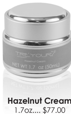
Hazelnut Cream 1.7oz.... $77.00

This creamy, vitamin-rich moisturizing face and body cream is ideal for severely dry, damaged, or sensitive skin, and contains food-grade vitamin A, D, and K supplements, along with sun-protecting avocado oil.