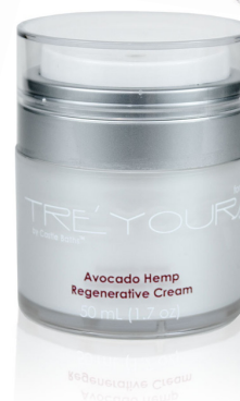
Avocado Hemp Regenerative Cream for Him 1.7oz.... $127.00

At last, an anti-aging face cream exclusively for men! This cream is ideal for daily moisturizing and as a natural sunscreen (Avocado Oil has one of the highest natural SPF ratings.) It is also ideal for dealing with sensitive skin following cosmetic surgery.