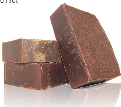
Vanilla Cocoa Spa Soap 3.5oz.... $12.00

When it comes to anti-aging soaps, this Low lather, easy rinse handmade bar is the gold standard. Our face soap is 80% moisturizing oils from cream. Great for acne, sensitive, and mature/aged skin.