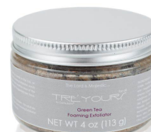
Green Tea Foaming Exfoliator 4oz.... $52.00

Get glowing skin with Castle Baths' Mediterranean Breeze Dead Sea Salt Bath Scrub so you'll look and feel like you just returned from a spa vacation in Italy!