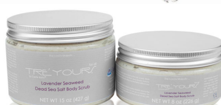
Lavender Seaweed Dead Sea Salt Scrub 8oz.... $36.00 15oz.... $57.00

Castle Baths Ginger Lily Brown Sugar Body scrub helps hide fine lines and wrinkles, leaving skin smoother- glowing, less dull, and softer, while removing dead skin and lifting blackheads which are lodged deep in the pores.