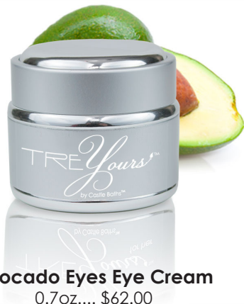
Avocado Eyes Eye Cream 0.7oz.... $62.00

Keep your face healthy and youthful with Tre'Yours - Castle Baths natural anti-aging system for skin over 40. Enjoy our simplest, purest, most natural formulations, with no added extras - only using the most powerful, natural ingredient combinations directed to give your skin the highest quality impact.