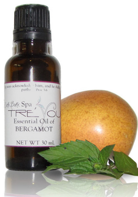
Essential Oil of Bergamot 30ml.... $18.00

Essential Oils are much more than simple fragrances. They are the essence of the herbs and flowers from which they are extracted, quite literally, a life force or aura - hence the name, essential oils. Aromatherapy is the practice of passing these auras and their rejuvenating properties onto humans via inhalation of their scents and/or absorption through the skin.