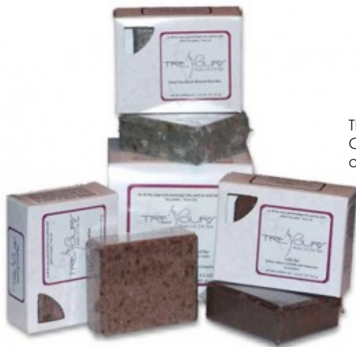
3 Pack Spa Soap Gift Set $62.00

Made with Hemp Seed Oil and the Essential Oil of Eucalyptus to produce a masculine scent many women find sexy. Both are also very beneficial to your skin - delivering moisture and nutrients to keep it looking and feeling youthful.