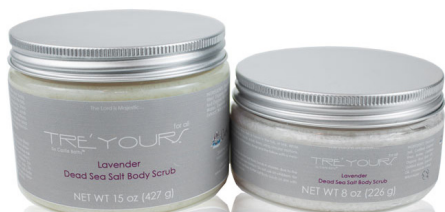
Lavender Dead Sea Salt Scrub 8oz.... $36.00 15oz.... $57.00

This mineral Dead Sea Salt scrub is perfect for teens or adults who want glowing, beautiful skin! Made with pure, authentic Dead Sea Salt and 20% Certified Organic Shea Butter!