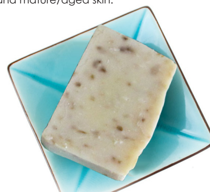
French Lavender Spa Soap 3.5oz.... $12.00

This bar of soap gives you the relaxing yet also energizing blend of lavender and rosemary. It contains fresh organic Rose Petals for a natural exfoliation, and is enriched with Certified Organic and Certified Fair Trade Cocoa Butter to help aid sun damaged skin.