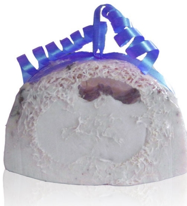
Exfoliating Loofah Soap for Him 5oz.... $17.00

This unique bar of natural soap merges the cleansing and moisturizing powers of natural soap with the gentle exfoliating abilities of a loofah to allow you to cleanse, exfoliate, and moisturize all at the same time.