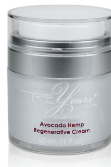
Avocado Hemp Regenerative Cream for Her 1.7oz.... $127.00

Providing soothing relief, along with the hydration and vitamins your skin needs to repair itself, is precisely what Tre'Yours Avocado Hemp Regenerative Cream is formulated to do - especially for women with sensitive skin.