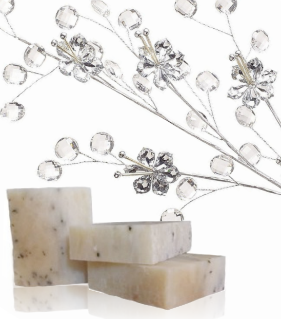
Naked Hemp Soap for Him 5oz.... $17.00

Sometimes smooth and silky is not what you need. Sometimes you need something a little more rough around the edges to really get your skin clean and polished. This unique Exfoliating Loofah Soap for Him is designed to do just that.