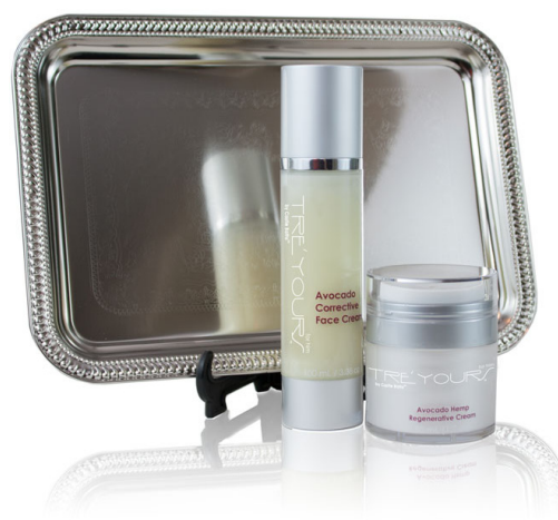
Avocado Corrective Face Cream & Hemp Regenerative Cream Combo for Him $259.00

Made with organic Rose Hydrosol (flower water), our Skin Toner restores and balances proper pH, clarifies complexion. It also contains Rose Hydrosol's anti-aging properties to help reduce the appearance of fine lines and tone skin!