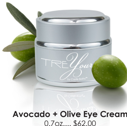
Avocado + Olive Eye Cream 0.7oz.... $62.00