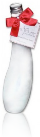
Facial Toner 10oz.... $110.00

Two luxurious natural skin care products bundled together! Use our Avocado Face Cream during the day and our Hemp Regenerative Cream at night for beautiful, healthy skin!